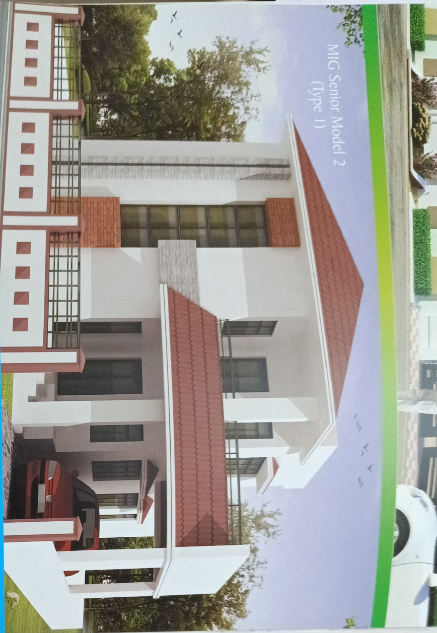
MIG Senior Model 2 (Type 1)