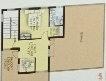
FIRST FLOOR PLAN (TYPE 1)