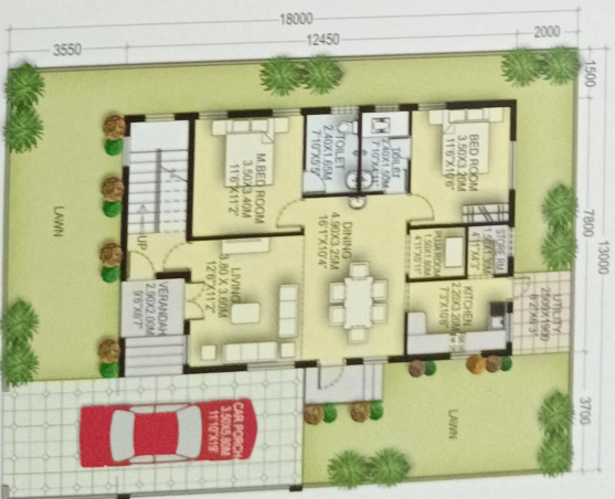
GROUND FLOOR PLAN (TYPE 1)

PLOT AREA 13.0 M x 18.0 M / 234 Sq. Mts. / 2517.84 Sq. Fts. GROUND FLOOR Built-Up Area - 104.75 Sq. Mts. / 1127.1 Sq. Fts. FIRST FLOOR Built-Up Area - 49.00 Sq. Mts. / 527.24 Sq. Fts. TOTAL BUILT-UP AREA 153.75 Sq. Mts. / 1654.34 Sq. Fts.