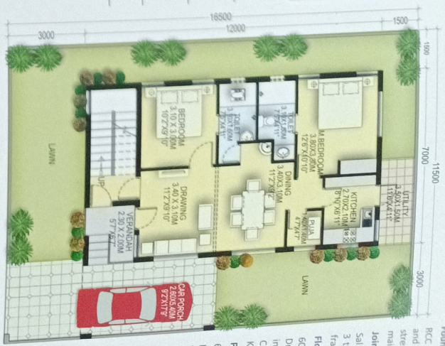
GROUND FLOOR PLAN (TYPE 2)

PLOT AREA 11.5 M X 16.5 M / 189.75 SQ. MTS. / 2041.71 SQ. FTS. GROUND FLOOR Built-Up Area - 89.83 SQ. MTS. / 966.5 SQ. FTS. FIRST FLOOR Built-Up Area - 10.2 SQ. MTS. / 109.75 SQ. FTS. TOTAL BUILT-UP AREA 100 SQ. MTS. / 1076.25 SQ. FTS.