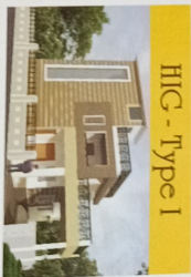
HIG - Type 1

PLOT AREA 13.0 M x 18.0 M / 234 Sq. Mts. / 2517.84 Sq. Fts. GROUND FLOOR Built-Up Area - 104.75 Sq. Mts. / 1127.1 Sq. Fts. FIRST FLOOR Built-Up Area - 49.00 Sq. Mts. / 527.24 Sq. Fts. TOTAL BUILT-UP AREA 153.75 Sq. Mts. / 1654.34 Sq. Fts.