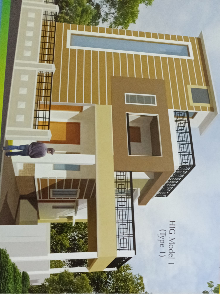
HIG Model 1 (Type 1)